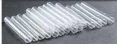
Item 6: Meth Test Tubes