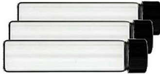
Item 7: Vials for Cocaine

I hope this meets you in good health and ongoing memories of The Supreme Personality of Godhead!