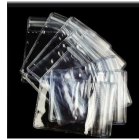
Item 4: Drug Envelopes