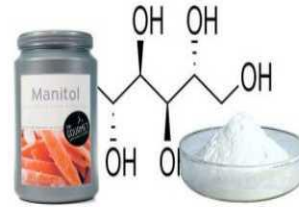
Item 9: Manito powder