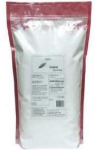
Item 10 : Inositol