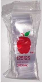
Item 1: Tiny Bags