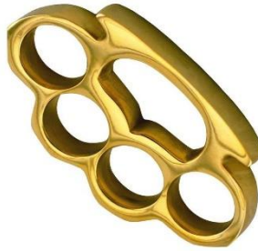
Item 8: Brass knuckles