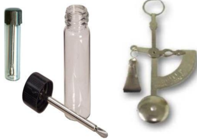
Item 2: Cocaine Vial Item 3: Drug Scale