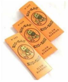
Item 5: Rolling Papers